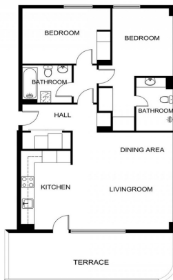
the bottom pictures is indicative - not to scale