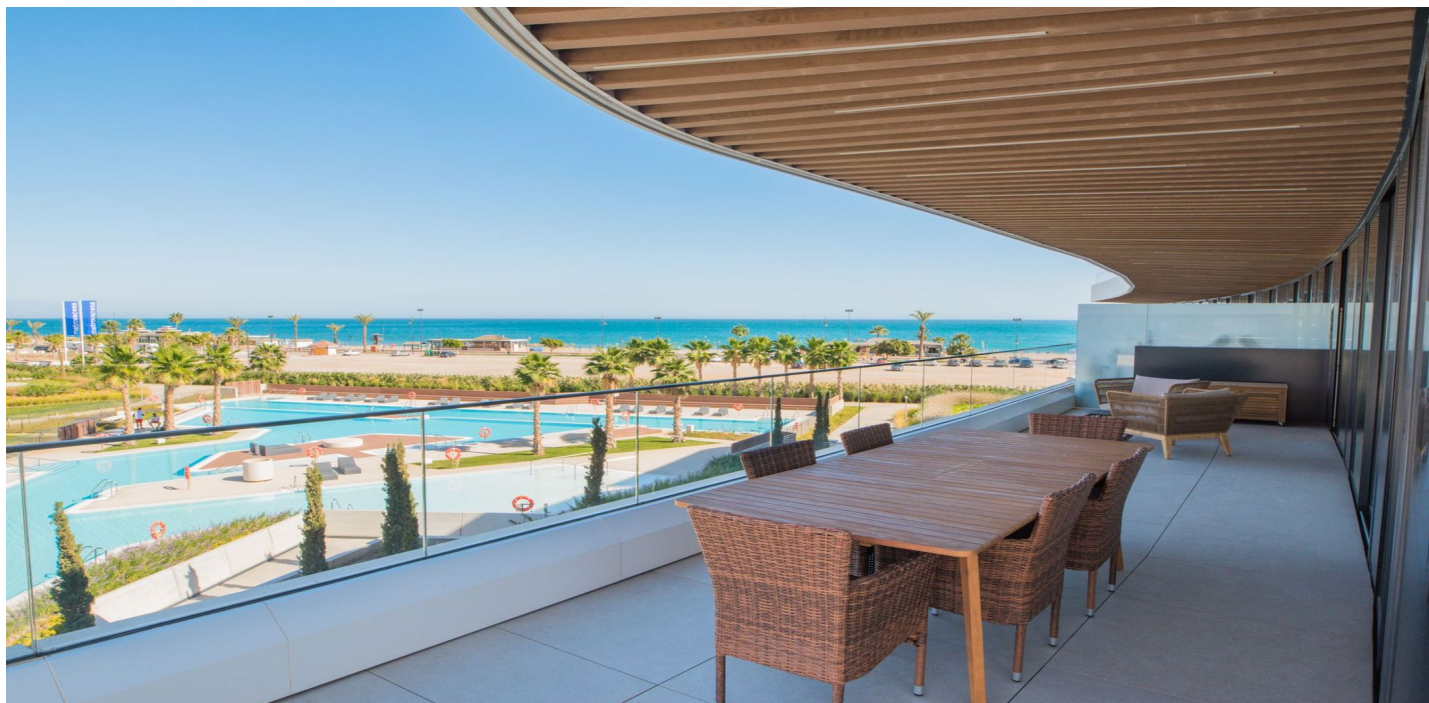
Parcela B4 " La Cizafia " Torremolinos

Referentie: R5007514 Slaapkamers: 4 Badkamers: 3 Perceelgrootte: 350m 2