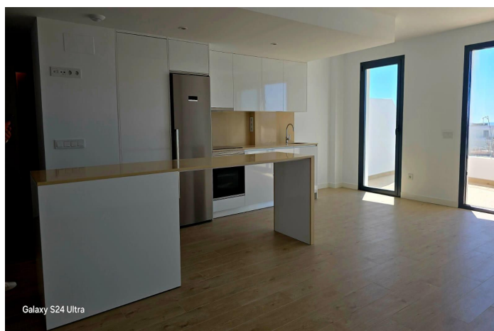
Galaxy S24 Ultra