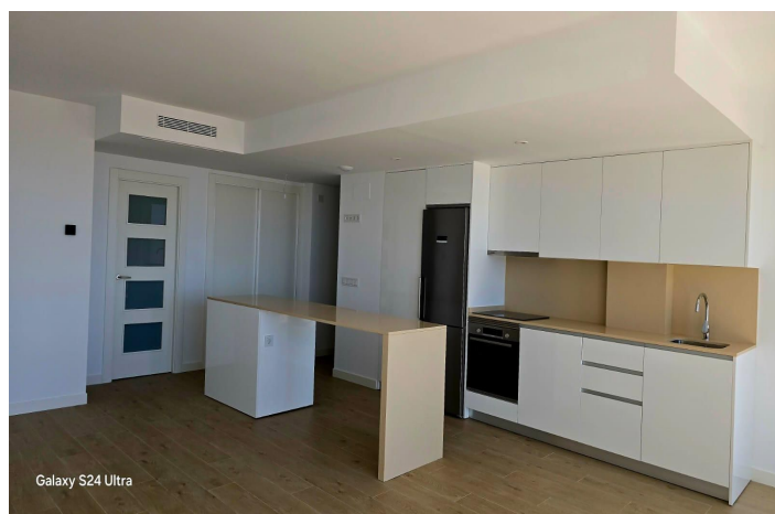
Galaxy S24 Ultra