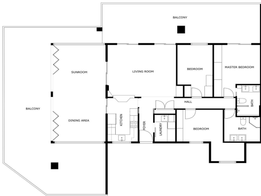
SIZES ARE APPROXIMATE, ACTUAL MAY VARY.